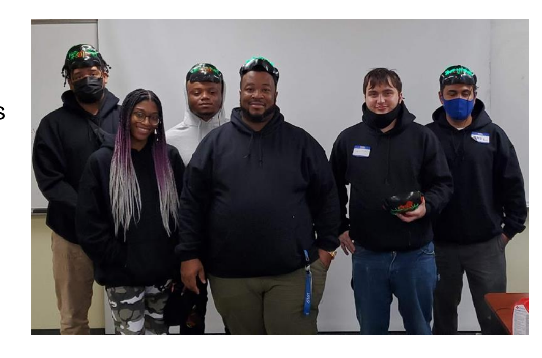
Bluegrass Community & Technical College Cybersecurity Scavenger Hunt student workers