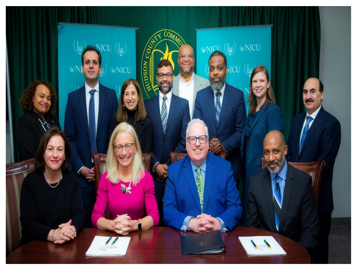
NJCU signed an Official Cybersecurity Articulation Agreement with Hudson