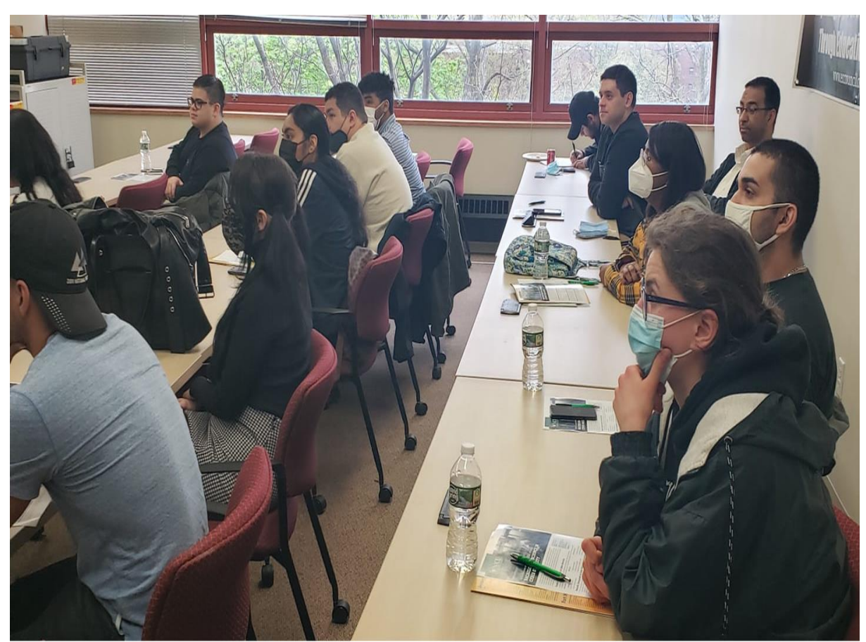
NJCU Cybersecurity Lab Workshops